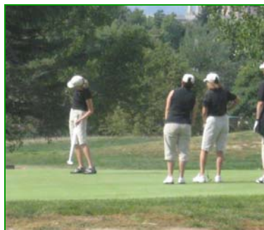
An awesome foursome