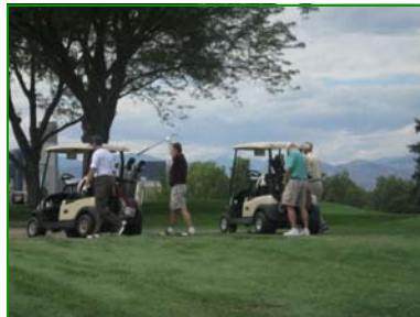
Is this the 19th hole?