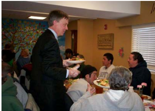
Mayor John Hickenlooper helps serve lunch to our guests during his visit December 18, 2007.